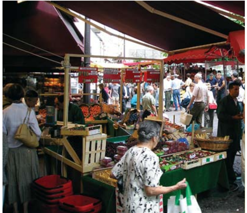
A scene from the Mouffetard Market, June 2007

10507 Timberwood Circle, Suite 214 Louisville, Kentucky 40223 Phone: 502.327.8529 Fax: 502.327.8065